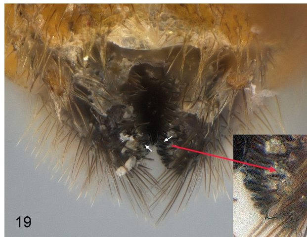
Fig. 19: Aprosthemata tardum . Apex of sawsheath (valvulae 3), dorsal view (BVLS084). White arrows indicate spines on valvula inner surface. Inset: detail of spines.