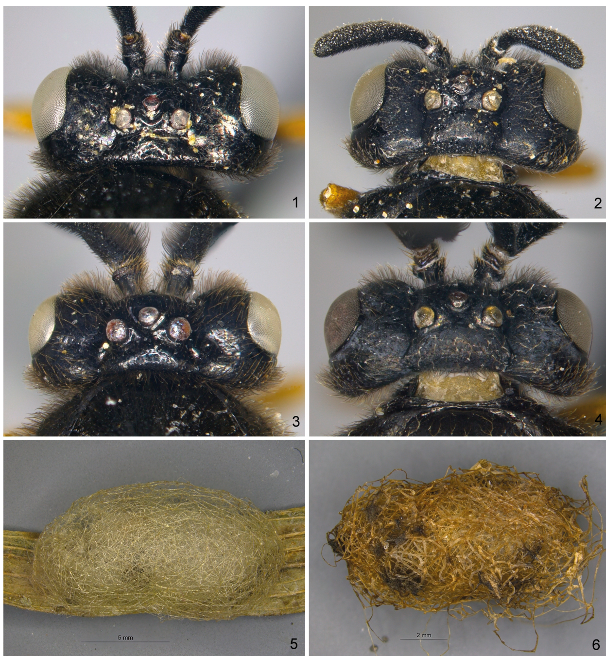
Figs 1–6: Aprosthema tardum . Head shape, dorsal view: 1, summer morph, female (BVLS084). 2, winter morph, female (BVLS040). 3, summer morph, male (BVLS024). 4, winter morph, male (BVLS039). For collection and rearing data, see Table 2. Cocoons: 5, made by an individual emerging in the same summer (BVLS084). 6, made by an overwintering individual (BVLS040).